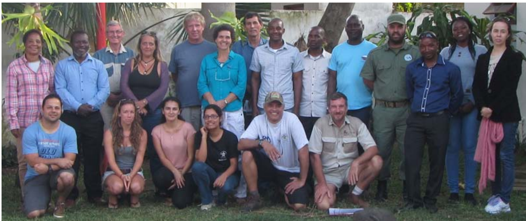
Participants of the official celebration of the 20th anniversary of the monitoring and conservation programme at the Ponta do Ouro Partial Marine Reserve, Mozambique.